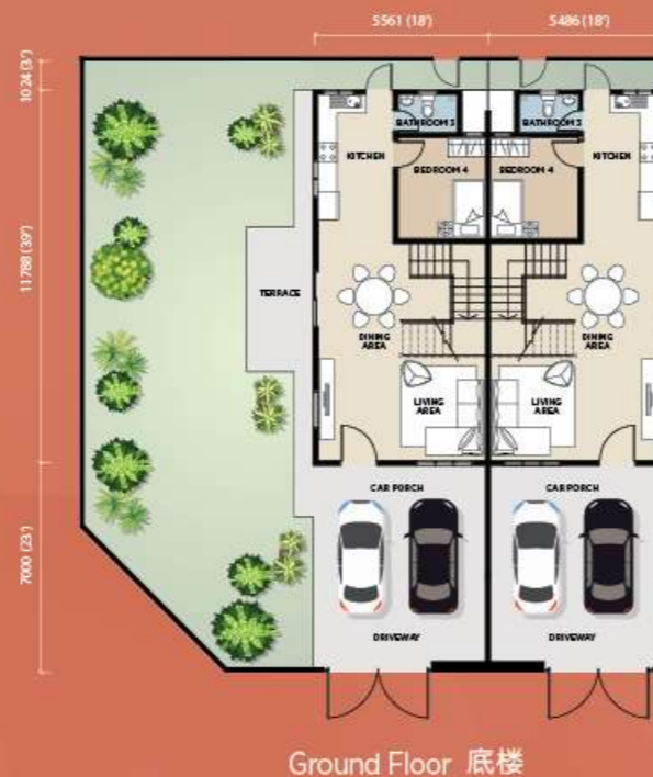
Ground Floor 底楼

FLOOR PLAN 平面图 LAND SIZE 土地面积: 18' x 65' BUILD-UP AREA 建筑面积: 2,082 sq.ft.