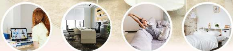
Working space Study area Leisure room Bedroom

4 BEDROOMS + 3 BATHROOMS + MULTI-FUNCTIONAL SPACE