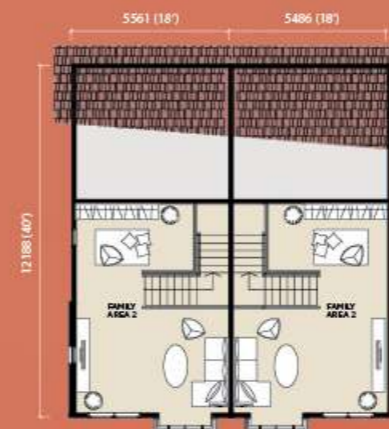
Second Floor 二楼