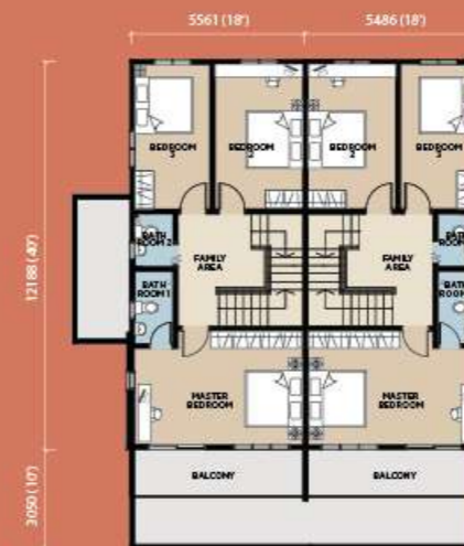
First Floor 一楼