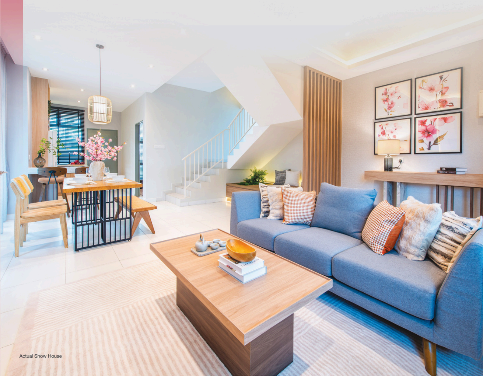
Actual Show House

Discover a more fulfilling way of living in this custom-designed sanctuary, where you'll find a refreshing environment that fosters the harmonious growth and unity of families.